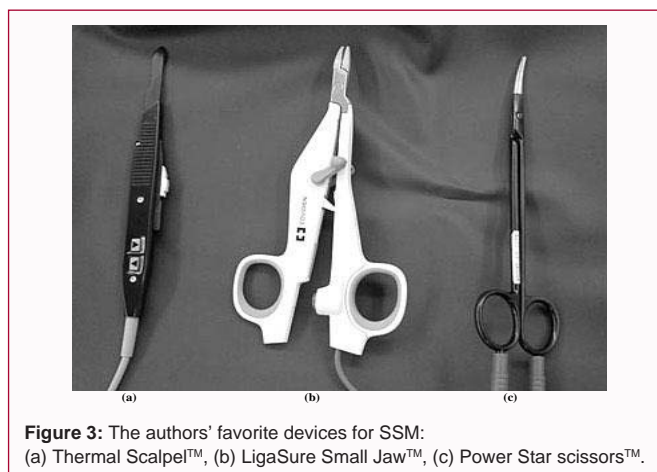
Figure 3: The authors’ favorite devices for SSM: (a) Thermal Scalpel™, (b) LigaSure Small Jaw™, (c) Power Star scissors™.

Figure 3 shows our favorite devices for SSM: a heated scalpel system (Thermal Scalpel™, Hemostatix Medical Technologies, LLC, Bartlett, TN, USA), vessel sealing system (LigaSure Small Jaw™, Covidien, Boulder, Colorado, USA), bipolar scissors (Ethicon POWERSTAR™ scissors, Johnson & Johnson Co, New Brunswick,