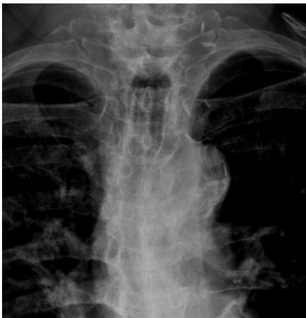
Figure 2: Radiograph demonstrating stent in mid-trachea.

requested, followed by CT scan and visualization with bronchoscopy, the gold standard [2]. Treatment options regarding tracheal-gastric fistula include both operative and non-operative approaches. We treated our patient with a covered, flexible endotracheal stent. Airway stenting, using an endoscopic approach, has been used for proximal