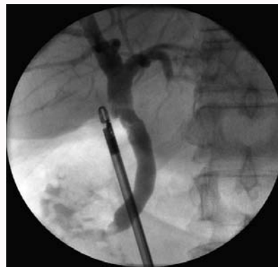
Figure 3: Cholangiogram attained from IOC during SILC.