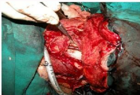
Figure 3c: The flap edges were de-epithelialized and sutured double layered.