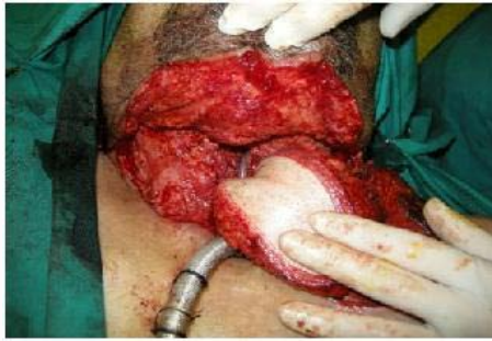
Figure 1c: The PM flap has been inset partially at the oesophageal defect.