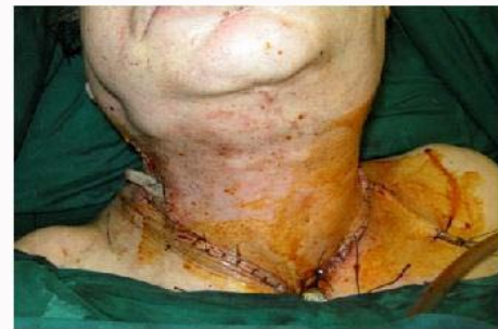
Figure 2d: The neck skin flap was closed primarily.