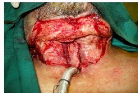
Figure 1a: Partial oesophageal defect where the anterior wall has been resected and the posterior wall was present.

The musculocutaneous PM flap is a type V Mathes-Nahai classification flap, based on the pectoral branch of thoracoacromial artery and venae comitantes as the dominant pedicle [1]. The PM flap is used for partial hupo pharyngoesophageal defects. The skin island is used for the 'lining' and a 6 - 8 × 10 cm skin 'patch' is usually sufficient. The muscle can provide wound cover and a bed for skin grafting (Figures 1a-1e). The RFF is a fasciocutaneous type B Mathes-Nahai flap based on the radial artery and venae comitantes and cephalic vein as the dominant pedicle [1]. The flap design should be tailored to the size of the defect. For partial defects a 'patch' 6 - 8 × 10 cm of skin island is usually sufficient (Figures 2a,b). For circumferential defects