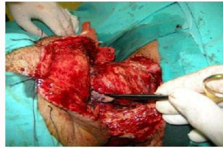
Figure 5a: Dehiscence of the proximal anastomosis and fistula formation at a patient who underwent RFF reconstruction for a circumferential defect.

The advantages of the PM flap include the standard anatomy, ease dissection, single stage procedure, low perioperative mortality, high success flap rate, and no need for microsurgical training [8]. The disadvantages are related to the geometry of the flap, making it a suboptimal reconstructive choice. The bulkiness of the flap does not match with the thin and pliable tissue of the hypopharyngeal and oesophageal wall. The large volume and downward traction of the flap may impair the mobility of the tongue, causing problems in swallowing and speech articulation, and the quality of voice rehabilitation is generally poor. This also associated with higher rate