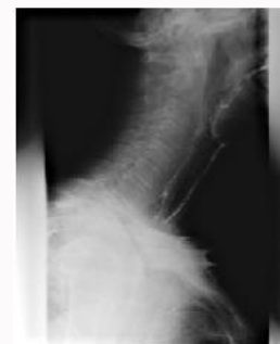
Figure 4c: The neo-tube was clearly defined.

and fistula formation. The first was treated conservatively, fed via gastrostomy and finally healed. The second patient who had undergone reconstruction of a circumferential defect was re-explored (Figure 5a) and the flap anastomosis was re-sutured primarily (Figure 5b), whereas he was fed via nasogastric tube for almost four weeks. Stricture was reported in one case and confirmed via endoscopy. A pouch formation at the distal anastomosis was documented in two cases, as there was a diameter discrepancy between the neotube (higher diameter) and the oesophageal stump. Two patients with PM reconstruction complicated with fistula formation and stricture. The first was treated conservatively, fed via gastrostomy and finally healed. The second patient was re-explored and the flap was re-sutured primarily. Two patients died in five and thirteen months. The first died due to tumour recurrence and the second due to lung metastasis respectively. Oral alimentation was achieved in eleven patients. One patient, who underwent PM reconstruction and had radiotherapy