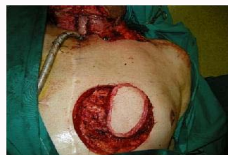
Figure 1b: The dissection of PM flap has been completed.

a larger flap up to 10×12 cm may be required, if the defect involves the hypopharynx from the tongue base and the cervical oesophagus (Figures 3a, 3b). A suprafascial dissection from distal to proximal