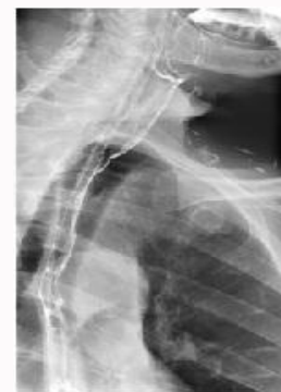
Figure 4b: The continuity of the alimentary tract in reconstruction of a circumferential defect was confirmed.