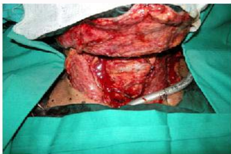
Figure 3d: The reconstruction of the circumferential defect was completed and the neo-tube was created.