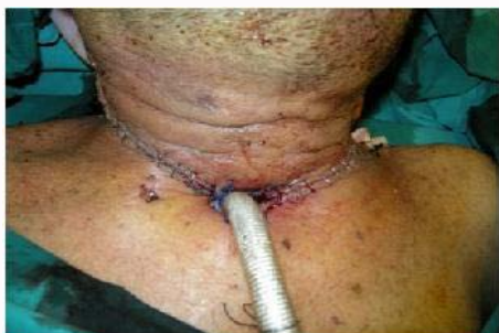
Figure 3e: The neck skin flap was closed primarily.

primarily, reconstructing the tracheostoma (Figures 2d and 3e).