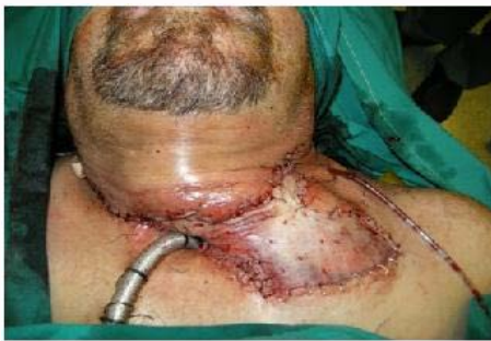
Figure 1e: A skin graft was placed over the PM muscle.