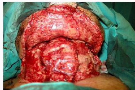
Figure 5b: The proximal anastomosis was re-sutured primarily.

of partial flap necrosis, wound dehiscence, pharyngocutaneous fistula formation (average 27%), distal stenosis and stricture (average 17%) comparing to other flaps [2]. The PM musculocutaneous flap is used as a salvage procedure in debilitating patients, for the reconstruction of partial circumferential pharyngoesophageal defects, when a free flap reconstruction is contraindicated [2].