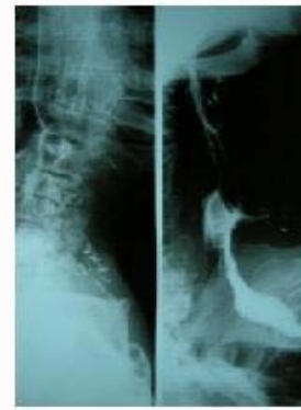
Figure 4a: The reconstruction of a partial defect and continuity of the alimentary tract was confirmed by swallowing test with gastrografin.

All flaps survived. The integrity and continuity of the alimentary tract was confirmed by swallowing test with gastrografin (Figure 4a-4c). The successful outcome was associated with oral alimentation, good uncomplicated swallowing and improved quality of life. Two patients with RFF reconstruction had flap anastomotic dehiscence