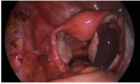
Figure 1: An overview of ovarian endometrioma which contains sticky chocolate-colored fluid that originates from previous bleeding within the ovary.