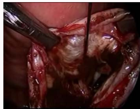
Figure 4: Vasopressin injection: 3-4 points on the boundary between the ovarian parenchyma and the cystic wall while avoiding large vessels before separating the cystic wall from the ovary.

gauze is lifted to inspect the lesion. To prevent the blood clot from collapsing, the gauze is removed after the bleeding is stopped. If the gauze becomes stuck to the newly formed blood clot, the clot is rinsed with a saline solution that has not been treated with heparin, and the sponge is carefully removed from the treated site. Once bleeding stops, any substances that did not mix into the blood clot are lightly washed off. The FloSeal® that has fused with the blood clot is not physically separated, and any substances that have mixed with the blood clot are left as they are. The advantages of this procedure are that it is easy to perform and causes little tissue damage [22,23]. A recent systematic review and meta-analysis comparing hemostatic sealants with sutures and bipolar coagulation reported that hemostatic sealants had a smaller influence on ovarian reserve in terms of anti-Müllerian hormone (AMH) [24]. However, hemostatic sealant is expensive and has been reported to cause thrombosis or small bowel obstruction after use. They are also believed to be associated with risk for viral transmission, although no study to date has reported on this association [25-27].