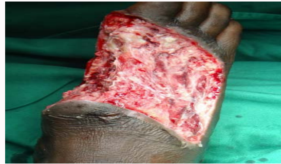
Figure 3: Wound of same patient after debridement. Healthy bleeding seen from tissue left behind.