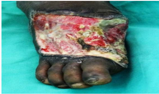
Figure 2: Dorsum of foot before debridement showing necrotic tissue and slough.