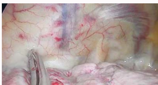
Figure 2: Intra thoracic anatomy of the origin of the lateral costal artery before thoracoscopic ligation.

artery, below the innominate vein, towards the thorax, between the clavicle and the first intercostal space. Given the features of this artery (Figure 2) and due to the high risk of occlusion of the internal mammary artery, it was decided that percutaneous management was not indicated in this patient, and so VATS ensued. A video assisted proximal ligation was performed close to the origin of the lateral costal artery using the Maryland technique, the vessel was occluded (Figure 3), a thoracic drain was placed for 24 h after the procedure and was later removed. Symptoms of angina improved considerably.