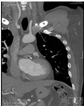
Figure 1: Origin of the lateral costal artery (Angiotomography).