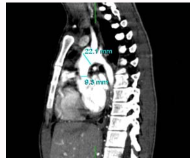
Figure 1: Multiplanar reconstruction image shows the diffusely stenosed ascending aorta in computed tomographic angiograms.

Copyright © 2018 Bilgehan Erkut. This is an open access article distributed under the Creative Commons Attribution License, which permits unrestricted use, distribution, and reproduction in any medium, provided the original work is properly cited.