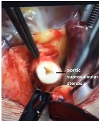
Figure 3: Supravalvular aortic stenosis during resection in operation.