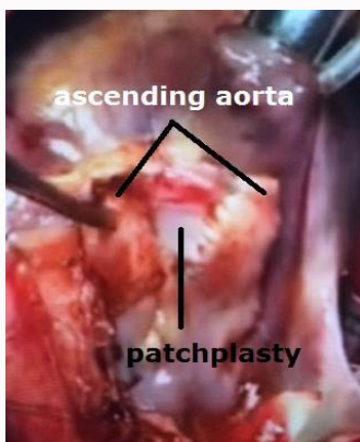
Figure 4: Image during operation of diamond shaped patch aorto-plasty with pericardial patch.