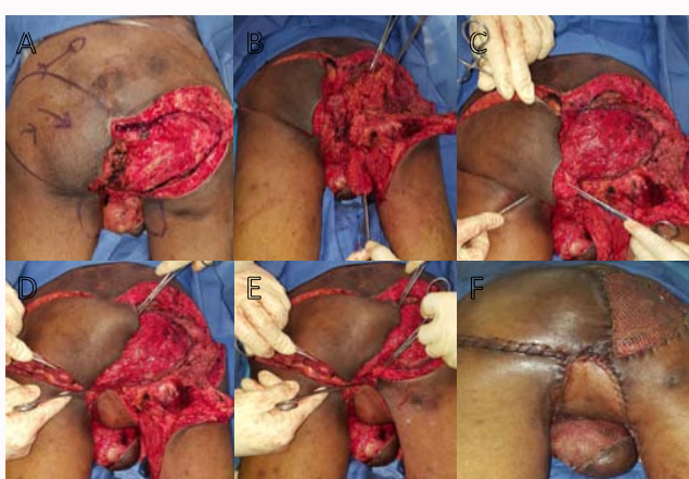
Figure 2: Reconstruction of defect. (A) Preoperative defect with planned surgery depicted. Left gluteal advancement flap. Right gluteal muscle advancement. Right medial thigh fasciocutaneous flap. (B) After flap dissection all of the flaps can be seen mobilized. (C) Closure of the rectal stump with bilateral advancement of the gluteal flaps. (D) Rotation of the right medial thigh flap to cover the perineum. (E) Advancement of right posterior thigh skin. (F) On-table postoperative result with meshed flaps inset and skin graft to right gluteus and scrotum.

colostomy and mucous fistula was performed by general surgery in anticipation of his excision and reconstruction. He recovered uneventfully from his ostomy and was taken on postoperative day 8 for excision of his affected tissues (Figure 1). During this surgery, his anus was excised and rectal stump was closed with absorbable sutures. Methylene blue dye was infiltrated through all external sinuses and involved tissue was aggressively debrided including his scrotum, right gluteal subcutaneous fat and skin, and perineum. At the end of this surgery he was continued on Vancomycin and Meropenem and his wound was packed with Dakin's wet-to-dry dressings daily and his condition was followed on the wards. After one week it was confirmed that his remaining tissues were clear of disease, and he was taken on postoperative day 11 (debridement)/19 (ostomy) for final