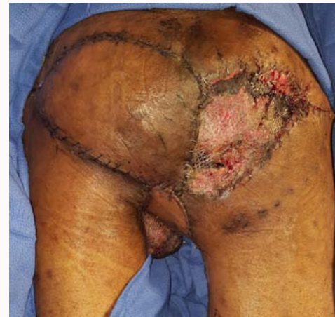
Figure 3: Postoperative day eleven result. Flaps and skin graft viable and intact. Rectal stump successfully covered and perineum protected by robust medial thigh rotation flap.

colostomy and mucous fistula was performed by general surgery in anticipation of his excision and reconstruction. He recovered uneventfully from his ostomy and was taken on postoperative day 8 for excision of his affected tissues (Figure 1). During this surgery, his anus was excised and rectal stump was closed with absorbable sutures. Methylene blue dye was infiltrated through all external sinuses and involved tissue was aggressively debrided including his scrotum, right gluteal subcutaneous fat and skin, and perineum. At the end of this surgery he was continued on Vancomycin and Meropenem and his wound was packed with Dakin's wet-to-dry dressings daily and his condition was followed on the wards. After one week it was confirmed that his remaining tissues were clear of disease, and he was taken on postoperative day 11 (debridement)/19 (ostomy) for final