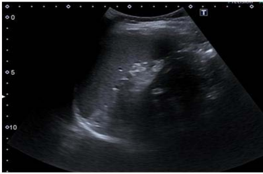
Figure 1: Ultrasonography showing normal sized spleen with normal morphology and echogenicity.