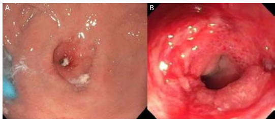
Figure 2: A) GJ anastomotic stricture pre-balloon dilation. B) GJ anastomotic stricture post-balloon dilation.