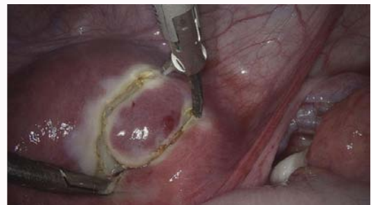
Figure 4: Identification of the area affected by AVM using harmonic scalpel.