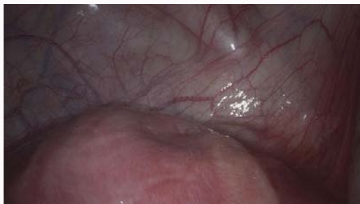
Figure 3: Depressed area on the anterior wall suggestive of AVM. Loss of consistency due to reduction of muscular component in the myometrium affected.