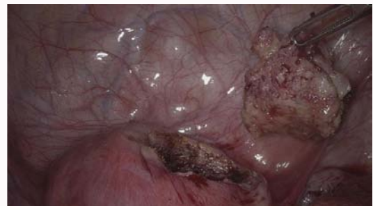
Figure 5: Full thickness myometrium excision by laparoscopy. The specimen includes the entire extension of AVM.

On the 30 th of November, a TVU showed decidual remnants and the presence at the anterior uterine wall of 3 vessels running across the myometrium and reaching the endometrium lining. The main vessel's caliber was 2.3 mm. Progestin-only pill (Norethisterone acetate 10 mg per day) was prescribed. The patient took methylergometrine for 6 days before she came to our attention on the 20 th of December 2021, without resolution of the bleeding. She was hemodynamically stable, blood counts were as follows: Hemoglobin 134 g/L, White Blood Cells (WBC) 7.1 \times 10^9/L , hematocrit 42%, platelets 370 \times 10^9/L , PT 1.0, aPTT 27 sec, glucose blood level 75 mg/dl, creatinine blood level 0.73 mg/dl, sodium 141 mmol/L, potassium 4.1 mmol/L, hCG level negative. TVU documented a uterus normal in shape and dimension; at the level of the fundus, an image suggestive of chorionic remnants and an area of chaotic high-flow vascularization to full thickness on the anterior uterine wall were found, reaching the endometrium lining (Figure 1A, 1B). Doctors decided to perform a diagnostic hysteroscopy to evaluate the formation inside the uterine cavity (Figure 2). Informed consent was taken for diagnostic hysteroscopy, laparoscopic resection of the myometrium involved by