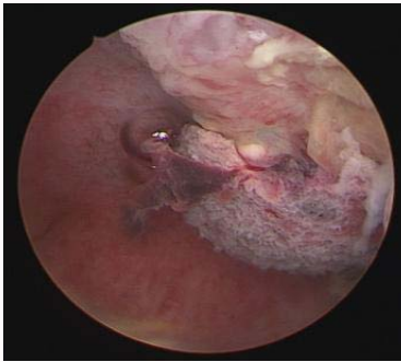
Figure 2: Hysteroscopy showing RPC adherent to the anterior uterine wall.