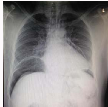
Figure 1: Chest X-ray showing bilateral air under the diaphragm.

Merlino and Reynolds (2004) review of 39 studies showed that penetrating trauma accounted for at least 80% of rectal injuries while 6.2% only were due to blunt mechanisms, one third of which were from Motor Vehicle Collisions (MCVs). A systematic (2017) review of available literature from 1999 to 2016, reporting on 1255 an rectal injury patients, showed that gunshot was the most common mechanism of injury (46.9%). Less common mechanisms of injury included explosive or blast injuries sustained in military combat (24.6%), knife stab wounds (0.49%) and foreign body injuries (2.47%). Although retained rectal foreign bodies have been reported in patients of all ages, and ethnicities, more than two-thirds of patients with rectal bodies are men in their thirties and forties, and patients as old as ninety years were also reported. However, there is a bimodal age distribution, observed in the twenties for anal autoeroticism or forced introduction through anus, and in the sixties mainly for prostatic massage and breaking fecal impactions [13]. The commonest cause of