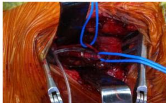
Figure 1: Repositioned the electrode 1cm caudal on the vagal nerve.

Copyright © 2018 Christian Raftopoulos. This is an open access article distributed under the Creative Commons Attribution License, which permits unrestricted use, distribution, and reproduction in any medium, provided the original work is properly cited.