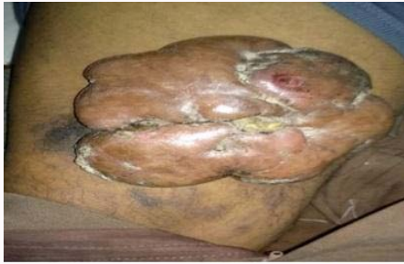
Figure 1: Swelling over the anteromedial aspect of right thigh.