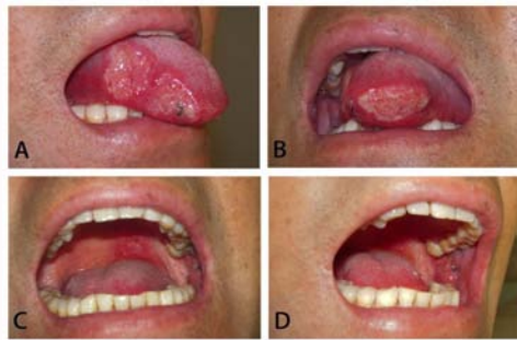
Figure 1: The tubercular ulcer on the tongue, soft palate and the left buccal mucosa.