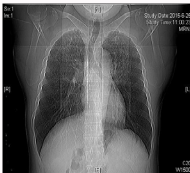
Figure 2: Chest radiograph (PA) showing normal lung parenchyma, trachea and mediastinum, without any fibrocavitary lesion.