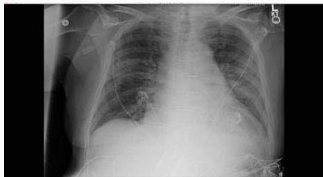
Figure 1: Chest radiograph demonstrating post-operative changes with bilateral infiltrates and a left pleural effusion.