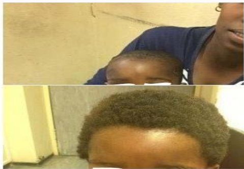
Figure 2: 2 weeks and 3 months postoperative.