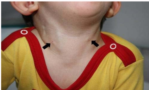
Figure 2: Bilateral second cleft fistula with mucoid discharge from the fistulae openings (Arrows: fistulae openings).