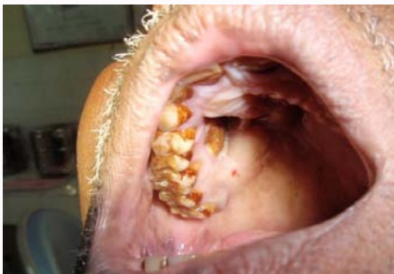
Figure 2: Preoperative intraoral photograph of case 2.