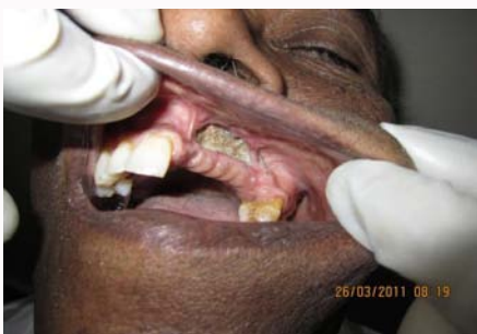
Figure 3: Preoperative intraoral photograph of case 3.