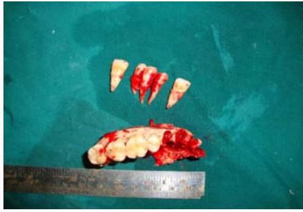
Figure 6: Resected specimen of case 4.