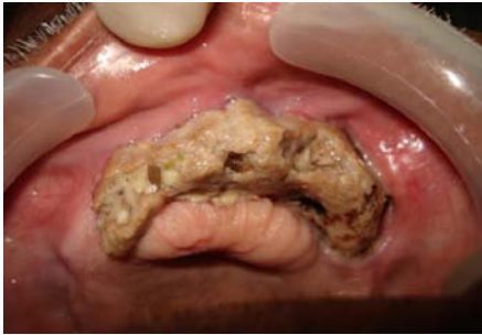
Figure 1: Preoperative intraoral photograph of case 1.