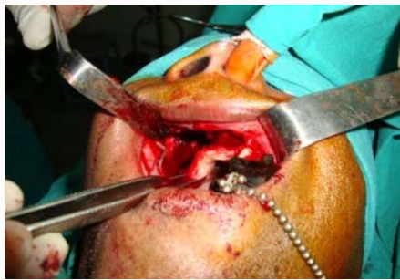
Figure 7: Intraoral view after resection of specimen.