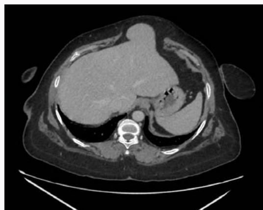
Figure 3: Axial CT scan image (venous phase) shows the herniated liver parenchyma through the epigastric anterior abdominal wall defect, the herniated part appear isodense to the normal liver.