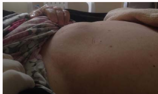
Figure 4: Incisional hernia through sternotomy incision.

possibility of multiple disc prolapses. After two days of conservative management in hospital, her pain was relieved, her blood sugar was controlled, and her parameters were good. She was discharged home in a good general condition. For the next three months patient was asymptomatic.