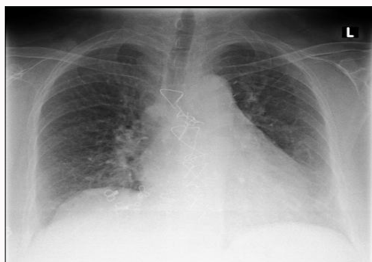
Figure 1: Plain chest X-ray showing median sternotomy closure with interrupted stainless steel wires.