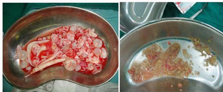
Figure 3 and 4: Showing resected specimen: Multiple of daughter cysts and laminated membrane.