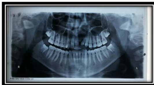
Figure 4: OPG showing filled alveolar defect.