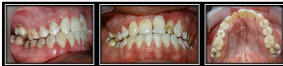
Figure 7: Post treatment occlusion.

cleft and is anatomically joined to the adjacent bone, becoming indistinguishable in radiographic images after an average period of 3 months [1].