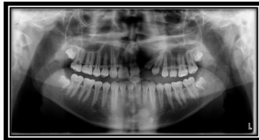
Figure 1: OPG of the patient showing maxillary alveolar cleft between left central and lateral incisors.

Bone grafting has become a common procedure in the treatment of cleft lip and palate patients. According to its time of occurrence, the bone graft may be considered as primary, secondary, or tertiary (late). When performed during early childhood, at the same time as the primary repair surgeries, bone graft is called primary. Bone grafting is called secondary when performed later, at the end of the mixed dentition. A secondary bone graft is performed preferably before the eruption of the permanent canine in order to provide adequate periodontal support for the eruption and preservation of the teeth adjacent to the cleft. Grafted cancellous bone fills in the residual alveolar