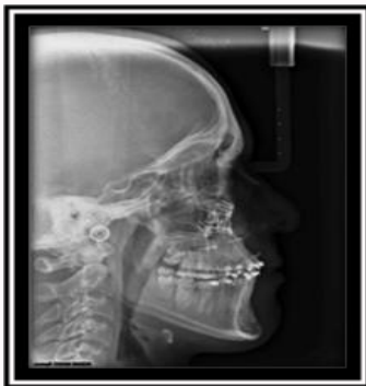
Figure 9: Post treatment ceph.