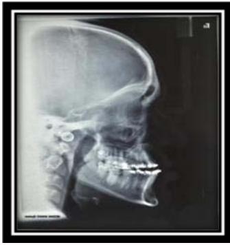
Figure 8: Pre treatment ceph.