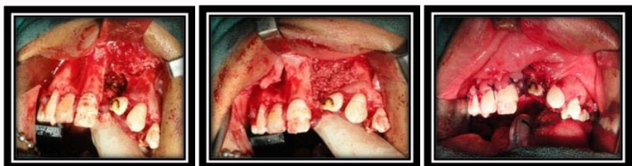
Figure 3: Bone grafting to recipient site.