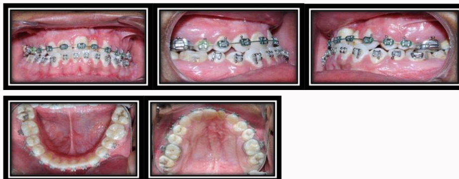
Figure 5: Intra-oral photographs showing pre-surgical decomposition of both arches.