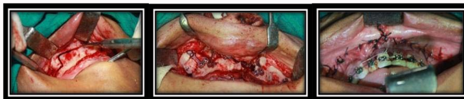
Figure 6: Intra-operative photographs showing Lefort 1 osteotomy with 4 mm maxillary advancement.