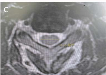
Figure 1c: Cord transverse diameter.

that if sagittal spinal canal diameter is less than 12 mm, the risk of cervical myelopathy is highly increased [8]. Zdenek Kadanka et al. [9] proposed that mJOA score has significant difference between patients with spinal cord sectional area less than 50 mm 2 and those greater than 60 mm 2 [9]. Other researchers used T2WI of spinal cord [10] or spinal cord deformation ratio [3] to decide. However, few brought up a definite parameter or a combination of these parameters for deciding responsibility segment.