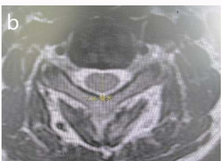
Figure 1b: Cord Sagittal diameter.