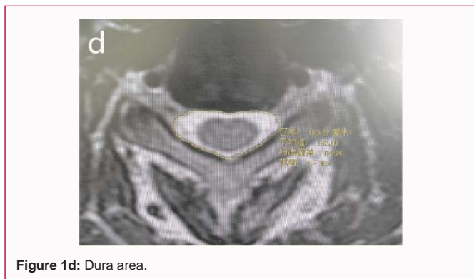
Figure 1d: Dura area.