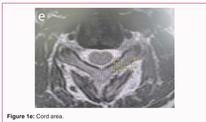
Figure 1e: Cord area.