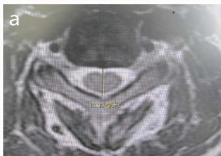
Figure 1a: Dura Sagittal diameter.