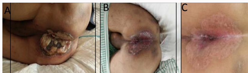
Figure 2A: Kaposi sarcoma patients with anal inflammatory ulcers and fungal infections. Figure 2B: Sigmoid colon fistula, autologous bone marrow preservation before and after chemotherapy, and after six courses of chemotherapy and comprehensive treatment, the surrounding anal ulcer basically healed. Figure 2C: Closure of sigmoid colostomy and complete healing of ulcer around anus.