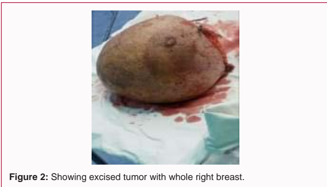
Figure 2: Showing excised tumor with whole right breast.