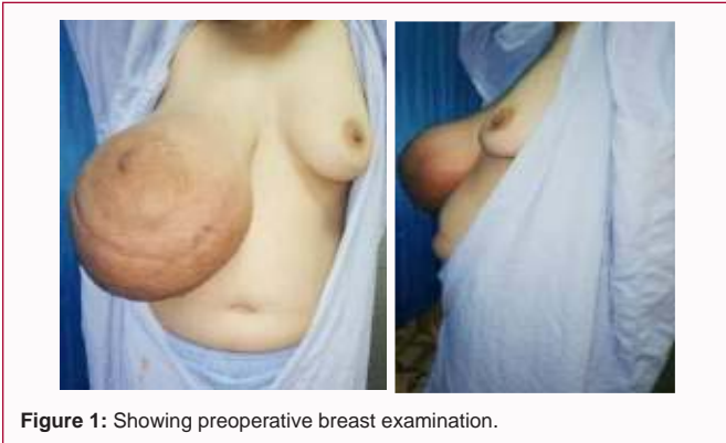
Figure 1: Showing preoperative breast examination.