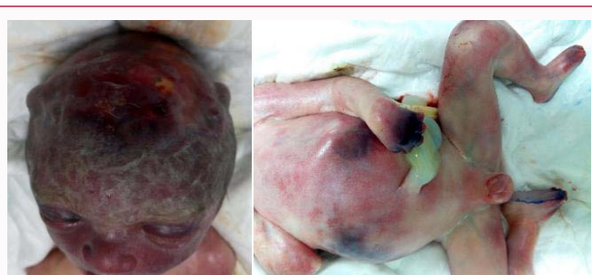
Figure 2: Postmortem examination. Note the characteristic hands and feet defects, cutis marmorata and aplasia cutis on the head.

fetoscopy, the video was reviewed together with pediatric specialists in the presence of parents, as previously committed. Parents could thus better understand the severity of the anomalies. After extensive discussion, parents requested a termination of pregnancy, which was accepted by an external committee. Postmortem examination (Figure 2) confirmed all the fetoscopic findings that were consistent with the AOS. Thereafter, exome sequencing identified a new heterozygous mutation in the gene NOTCH1 [ NOTCH1:c.1423C>Tp(Gin475Ter) ]. Later on, this mutation was also found in the father, whose physical examination was normal, with only mild venous insufficiency at the lower extremities.