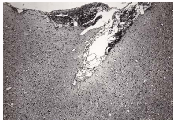
Figure 3: Photomicrograph of the right visual cortex stained with hematoxylin and eosin, showing neuronal cell loss and pyknosis (30 days after KA injection) at the injected site of visual cortex.