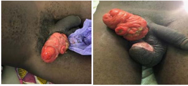
Figure 1A and 1B: Photographs showing the fistula at presentation (A) and before skin preparation in theatre (B).