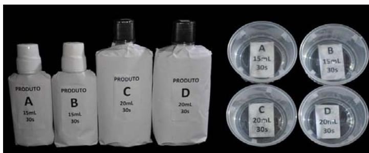
Figure 1: Mouthrinses bottles relabeled and on the original covers. Graduated 15 mL-measuring cups with their respective product identification label at the bottom (externally).