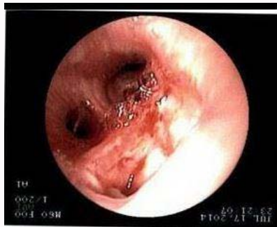
Figure 2A: Bronchoscopy at diagnosis, Case 2.