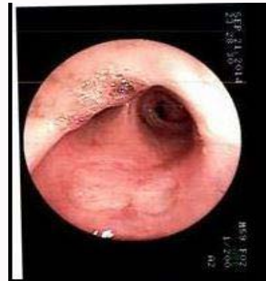
Figure 2C: Bronchoscopy at 60 days, Case 2.

The patient is a 34-year-old man with symptomatic paroxysmal atrial fibrillation. He underwent RFA at an outside hospital without apparent complication. The patient was discharged home. The patient returned in 24 h with severe coughing episodes, hypoxemia and dyspnea. Chest radiograph demonstrated pneumopericardium. He was intubated for respiratory failure and transferred to our institution. He was found to be hypotensive and hypoxemic on presentation. The patient was stabilized and taken to the operating room. He underwent bronchoscopy and subxiphoid pericardial drainage with placement of a 24 Fr. Jackson-Pratt drain. At initial presentation, there appeared to be dark, slough on the inferior wall of the distal