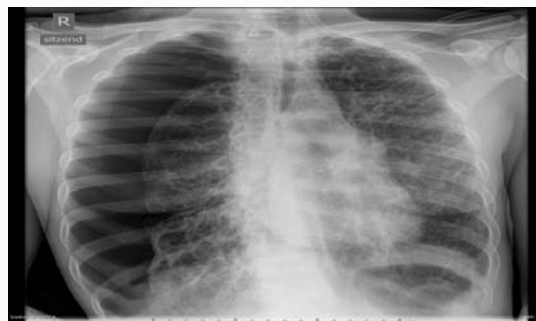
Figure 1: Chest X-ray at the day of admission with a tension pneumothorax on the right side. Emphysematous changes, cysts and fibrous strands are homogeneously distributed over both lungs.

Copyright © 2018 Welter S. This is an open access article distributed under the Creative Commons Attribution License, which permits unrestricted use, distribution, and reproduction in any medium, provided the original work is properly cited.