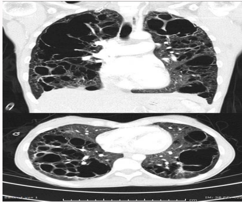
Figure 2: Chest CT-scan after insertion of a chest tube demonstrating large bilateral central cysts with thin walls surrounded by unchanged and slightly emphysematous lung tissue.