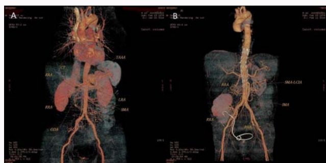
Figure 1: (A) Preoperative CT scan of the thoracoabdominal aortic aneurysm. (B) CT scan performed 3 days after the operation revealing good exclusion of the thoracoabdominal aortic aneurysm.