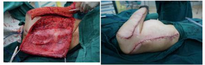
Figure 4: The expanded flaps were transferred to reconstruct the defect resulting from nevus removal.

the nevus excision. The expanded pedicle flap was then created for a tension-free donor-site closure before nevus removal. The width of the flap was designed on the basis of the length of the nevus, and the length of the flap was arm circumference. The expanded flap with a random pattern was at the width-to-length ratio of more than 1:3. The flap pedicles were placed on the side of the back when the flaps were used to resurface the posterior extremity. Three days after the surgery, the patient was treated with HBO 2 once a day for 5 days. The each HBO 2 treatment is at 2.46 atmospheres absolute (45 feet of sea water) for 90 min (Figure 4). Forth stage; flap separation and closure of skin around the extremity. The pedicle flap was separated from the trunk at 20 days after transfer. Then the patient was treated with HBO 2 as before (Figure 5). Fifth stage; the patient was treated with Ultra pulse CO 2 (carbon dioxide) fractional laser 3 times at 3-month intervals. Post-treatment wound utilizes moist exposed burn ointment. The skin in the surgical area was soft in the texture with flat scars (Figure 6). The patient was satisfied with the results of the procedures.