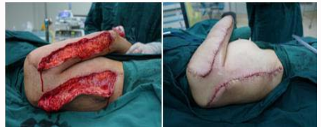
Figure 5: The pedicle flap was separated from the trunk and closure of skin around the extremity.