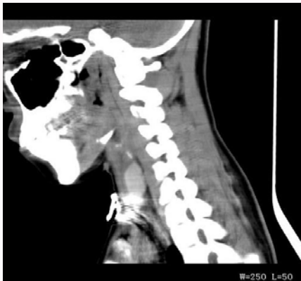
Figure 2: Case 2: CT scan. The laryngotracheal lumen was closed with diffuse calcifications and some laryngotracheal cartilage was destroyed.

with rheumatic arthritis, chronic cough, hoarseness, recurrent pneumonia, and dyspnea, then underwent tracheotomy and treated with prednisolone and antibiotic agents. He was admitted to our hospital for laryngotracheal reconstruction on November 2, 2008. The flexible bronchoscopy examination showed that mobility of bilateral arytenoid cartilages was reduced and that glottis was severely narrowed (<3.0 mm). The subglottis and cervical trachea had malacia and stenosis about 5.5 cm in length. The distal trachea was normal. The neck and chest X-ray and CT scans showed that the laryngotracheal lumen from thyroid cartilage to the level of the first thoracic vertebra was severely stenosis with focal calcification (Figure 1). Histological analysis of subglottic scar tissues presented chronic inflammation of mucosa, fibrous tissue proliferation and lymphocytic infiltration. The patient underwent laryngotracheal reconstruction by two stages. On November 7, 2008 stage one was performed with a rotary door sternohyoid myocutaneous flap, that the flap consisted of the sternohyoid muscle with corresponding overly skin (6.0 cm × 1.5 cm) for airway augmentation. Stage two was performed on November 25, 2008, when the laryngotracheal lumen was reinforced with two arch titanium meshes (diameter: 3.0 cm, width: 1.3 cm) as framework covered and sutured onto the sternohyoid muscle that was the previously made up rotary door sternohyoid myocutaneous flap.