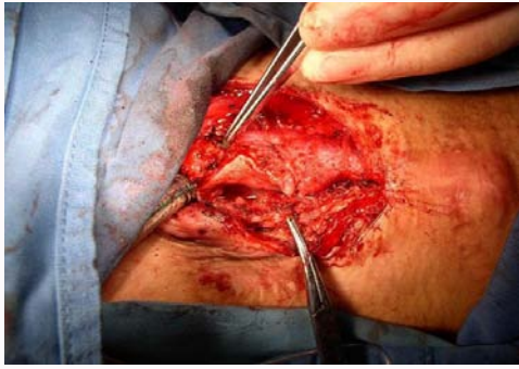
Figure 4: The sternohyoid myocutaneous flap was 180 degree rotation to cover the defect, and sutured to margins of the defect.