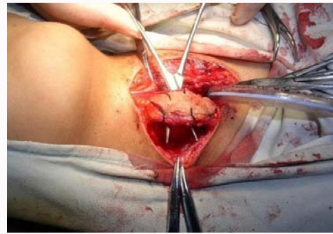
Figure 3: Laryngotracheal reconstruction with rotary door sternohyoid myocutaneous flap. The sternohyoid muscle was elevated and its amphipedicles were preserved.

Case 2: A 20-year-old woman presented with recurrent pharyngolaryngitis, nasal obstruction, headache, pneumonia and dyspnea prompted tracheotomy and who was diagnosed with RP