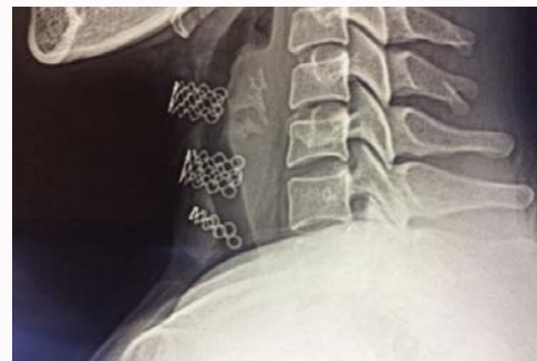
Figure 7: Case 2: X-ray at two year post-operation. The positioning of titanium mesh was good and the laryngotracheal lumen was wide.

complications in outpatients. The T-tube was removed from nine months to two years postoperatively.