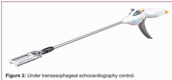
Figure 2: Under transesophageal echocardiography control.

Atrial fibrillation was present on the ECG, so anticoagulant therapy with Warfarin was continued.