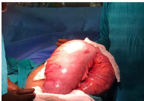
Figure 2: Massively dilated colon intraoperatively.