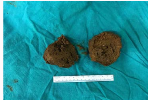
Figure 4: The phytobezoar that was removed from the sigmoid colon.

colostomy with closure of distal stump was done. On opening up the Specimen a large phytobezoar along with fecalith was impacted at the rectosigmoid junction.