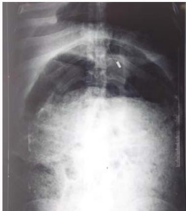
Figure 1: Straight X-ray Abdomen (erect) at the time of presentation.