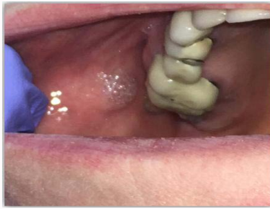
Figure 2: Frothy saliva expressed from the duct orifice.

department clinic with complaints of recurrent bilateral facial swellings. The facial swelling was spontaneous, intermittent, bilateral confined to the pre-auricular and parotid regions and were non-tender. She denied a history of meal time associated symptoms or pyrexia. There were no aggravating or relieving factors that could be identified. No identifiable systemic illnesses were found that could be related to her symptoms.