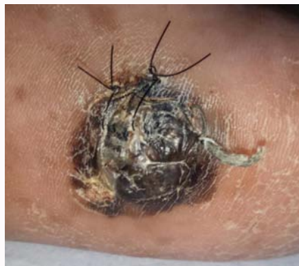
Figure 1a: Brownish black pigmented infiltrated nodular plaque with irregular border over right heel.

Copyright © 2019 Muthu Sendhil Kumaran. This is an open access article distributed under the Creative Commons Attribution License, which permits unrestricted use, distribution, and reproduction in any medium, provided the original work is properly cited.