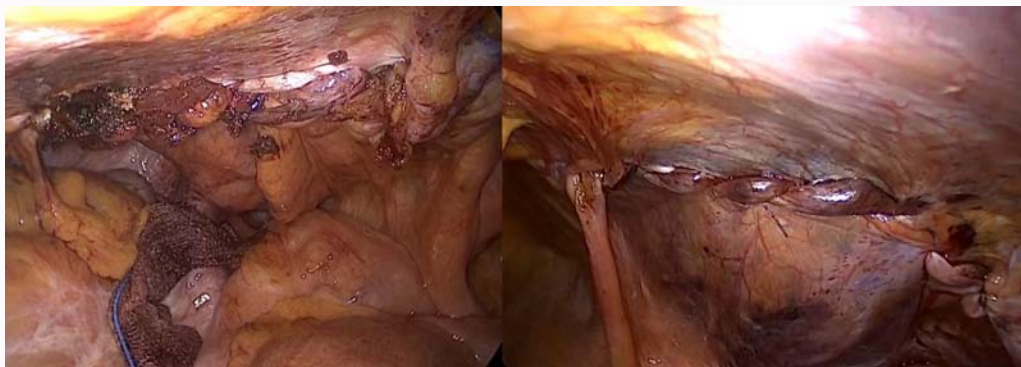
Figure 1: Laparoscopic images after laparoscopic hernia repair.