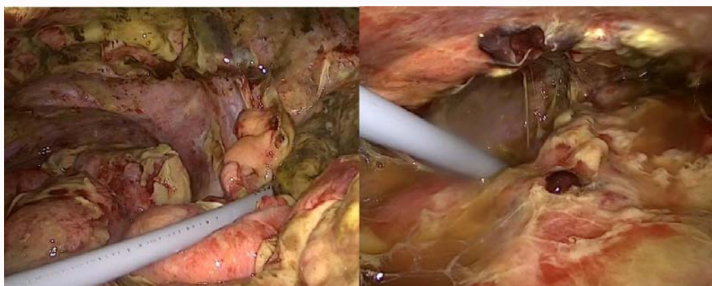
Figure 3: Laparoscopic images of bowel perforation and severe intra-abdominal contamination.

but did not remove the prosthetic mesh because the previous TAPP site was intact. The patient recovered well and was discharged on postoperative day 9. He has been followed up on for the past one year and has shown no signs of infection and he has a normal stool once a day.