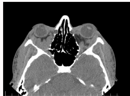
Figure 2: Compressive effect on the orbital components.

Copyright © 2019 Banafsheh Ghavidel-Parsa. This is an open access article distributed under the Creative Commons Attribution License, which permits unrestricted use, distribution, and reproduction in any medium, provided the original work is properly cited.