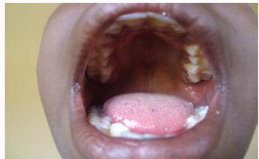
Figure 4: High arched palate.

There is no history of easy fatiguability or breathlessness. She is a product of normal spontaneous vertex delivery. The developmental history was apparently normal. Her intelligence and behaviour were normal. The child is the first born in a monogamous family of two. The father is a welder while the mother is a petty trader. There is no similar occurrence in her family.