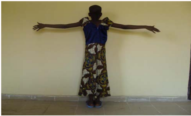
Figure 1: Full view of the patient.