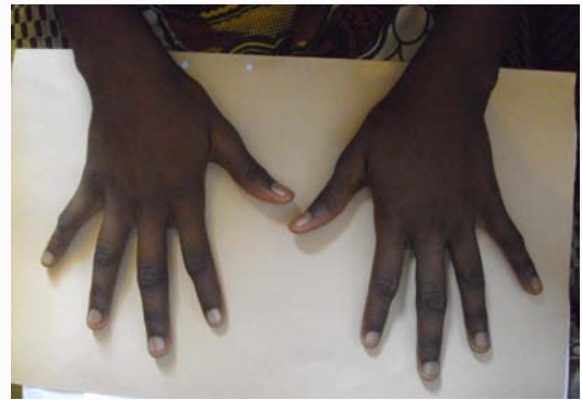
Figure 3: Arachnodactyly (Long Fingers).