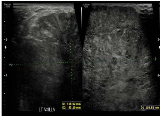
Figure 2: Ultrasound showed a specious large heterogeneously hypoechoic highly axillary mass with cystic changes and thickened skin.