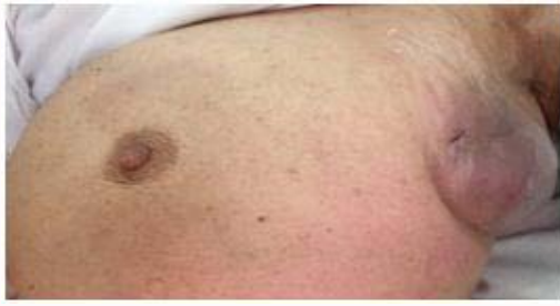
Figure 1: Demonstrates the hyperpigmented edematous axillary mass.