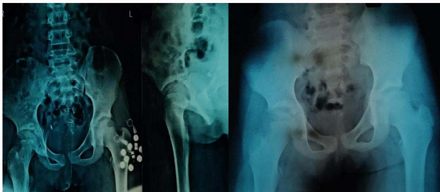
Figure 1: An AP and lateral view of pelvis both hips showing reduced joint space and sclerosing acetabulum and femoral head.