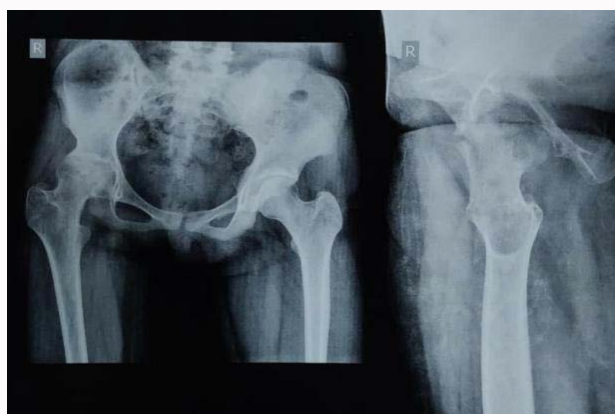
Figure 2: AP and lateral X-ray views of pelvis both hips showing significant joint space narrowing of the right hip and sclerosing acetabulum and femoral head and subchondral cyst.

since six months. The pain intensity was 6/10 on VAS scale. The pain aggravated on walking, partially relieved on rest and analgesics. The patient's complaints were also associated with weight loss, night sweats, and an evening rise in temperature. She had a previous consultation for the same elsewhere and was started on first line anti-tuberculosis treatment. She discontinued the treatment after a course of two months without been advised to do so. On admission, a hip aspiration was performed for the right hip following the X-rays (pelvic-both hips) and was sent for culture-sensitivity, gram staining & RT-PCR for Tuberculosis. Reports revealed Tuberculosis of Right Hip and she was again started on anti-tuberculosis treatment in 2019. Currently she came in again complaining of pain in the right hip which was associated a Trendelenburg gait with reduced stance phase on the affected limb. The range of motion of the right hip was reduced with flexion, and coronal and rotatory movements reduced. There was also a true shortening of the affected limb by about 1 cm. Again, an X-ray was advised following which, this time an MRI (Pelvis both hips) was done, which revealed avascular necrosis of the right Hip.