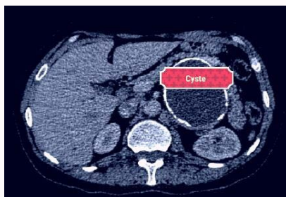
Figure 2: CT shows the adrenal cyste.

the cysts. Most adrenal hydatid cysts are incidentally detected at sonography or computed tomography [8]. Hypertension is an uncommon presentation and may result from external compression of the renal parenchyma, a state known as Page kidney [9]. In our review, 20 patients suffered from pain (74.07%), six patients from hypertension (22.22%), and four patients found incidentally (14.8%).