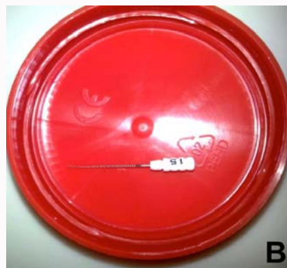
Figure B: Needle for dental root curettage after removing.