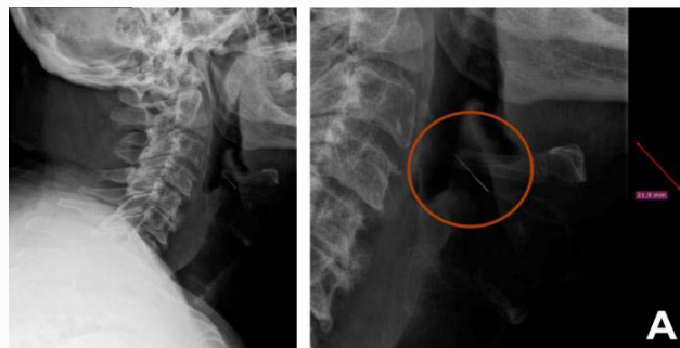
Figure A: On the left, cervical X-ray showing a metallic needle-shaped foreign body in the larynx; on the right enlarge detail of dangerous foreign body in the larynx.

Copyright © 2018 Pedruzzi B. This is an open access article distributed under the Creative Commons Attribution License, which permits unrestricted use, distribution, and reproduction in any medium, provided the original work is properly cited.