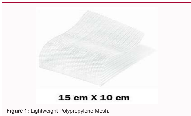
Figure 1: Lightweight Polypropylene Mesh.