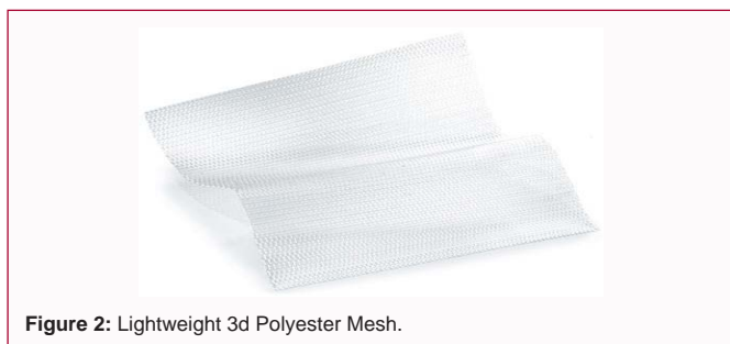
Figure 2: Lightweight 3d Polyester Mesh.