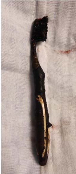
Figure 2: Toothbrush immediately after its removal.