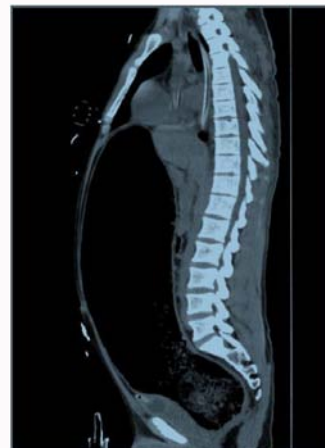
Figure 1: A diagnostic CT scan he was hit by pulse less activity cardiac arrest consequent to severe hyperkalemia.

We describe the case of a 22 year-old male affected by congenital anal atresia that underwent repairing surgery 20 years ago. During the last seven years he has been suffering from frequently occlusive episode. He arrived at the emergency department for severe abdominal pain, nausea and vomiting. His abdomen was very painful and taut. When the patient was waiting for a diagnostic CT scan he was hit by pulse less activity cardiac arrest consequent to severe hyperkalemia (Figure 1). After cardiopulmonary resuscitation the patient returned to spontaneous circulation and a hemodynamic stability was obtained. Therefore, diagnostic exams were completed; in particular CT scan demonstrated a severe colic dilatation (14 cm) causing compression on both the femoral artery and subsequent hypoperfusion (Figure 2). A surgical attempt was decided; total colic resection associated to fasciotomy of the legs was practiced with the aim to improve general condition and perfusion of the lower extremities. Unfortunately he died after 20 days of recovery in intensive care unit.