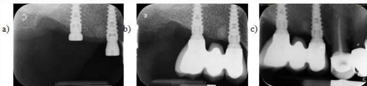
Figure 3: Sequence of periapical radiographs of one of the patients treated with JD Evolution implants with internal hex connection included in this study: a) implant placement; b) 1 year after loading; c) 5 years after loading.

made with the paralleling technique. Patients were prescribed Chlorhexidine digluconate 0.2% mouthwash twice daily for 1-week post-surgery. After 3 months all the implants were loaded directly with definitive screw-retained or cemented restorations (Figure 2, 3). The three operators involved in the trial (MC, TG and RS) made all clinical assessments; therefore outcome assessors were not blind.