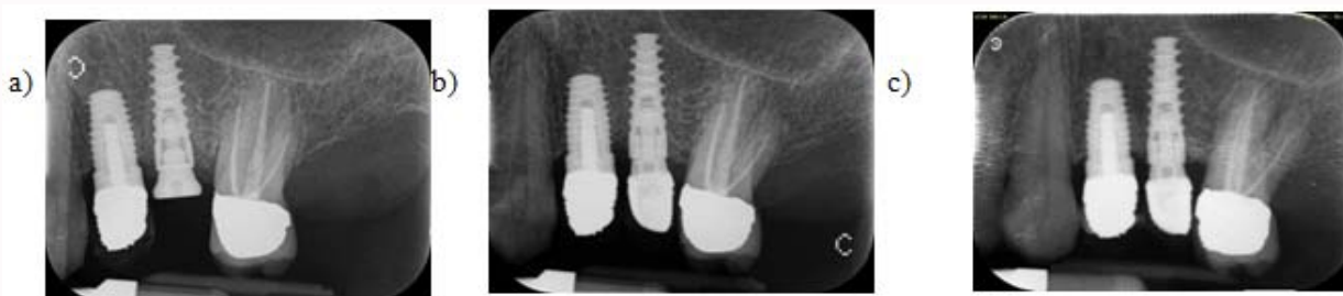
Figure 2: Sequence of periapical radiographs of one of the patients treated with JD Icon implant with conical connection included in this study: a) implant placement; b) 1 year after loading; c) 5 years after loading.